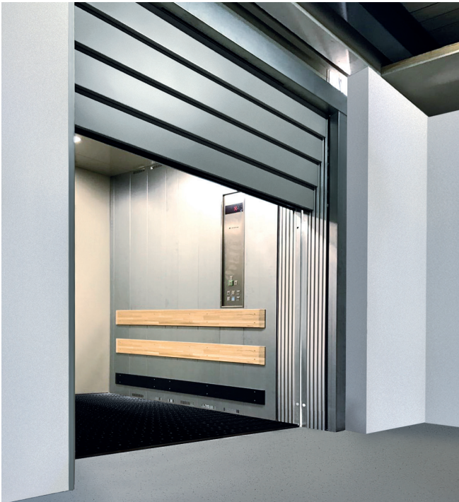
PREMIUS® lifting gates are now also available in explosion-proof versions.

Corresponding variants are also available for landing doors, so that existing entrance portals can be left in place, thus avoiding additional work and costs: Either a complete door mechanism that is mounted in the existing transom housing and connected to the remaining door panels (ComfortLine). Or - as with the car door - one additionally opts for dimensionally adapted door panels (RetroLine).