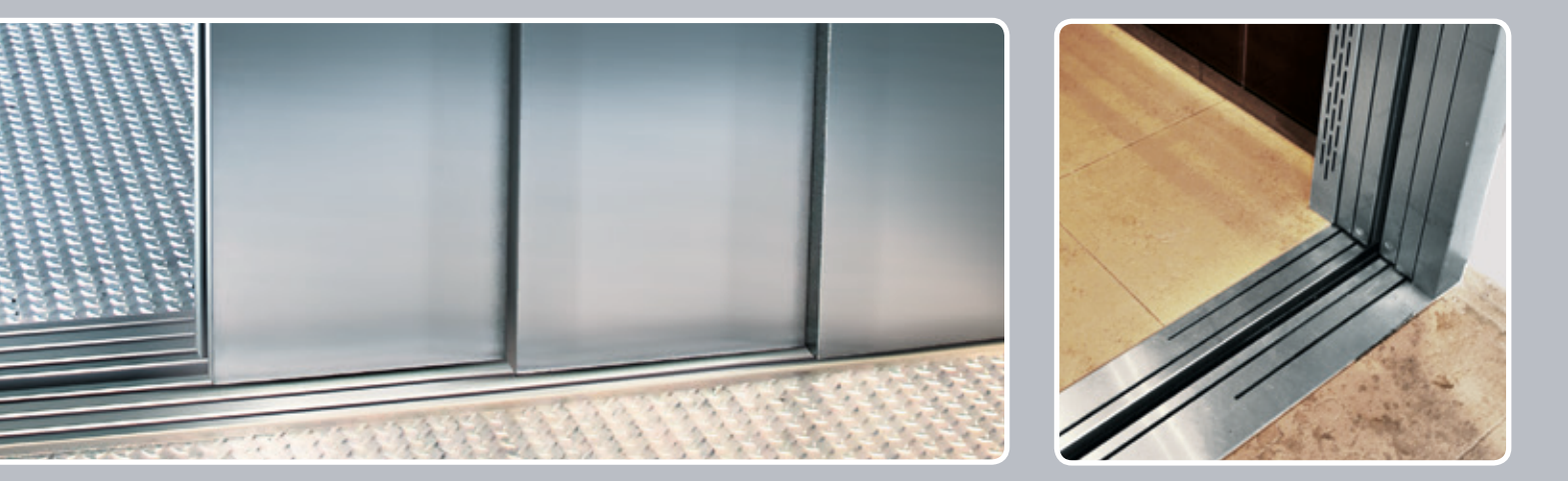
Lift Doors for Universal Use